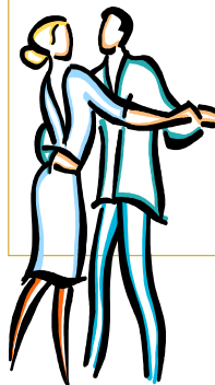
Dancing is great fun and fantastic exercise!

MADS Club: Murray After Dark Social Club is an out on the town evening with your Teachers and friends. It is held the first Wednesday of every month at 9:30 pm at a designated local dancing location. Ask